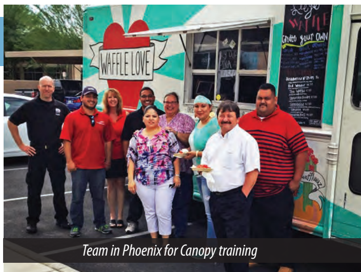
Team in Phoenix for Canopy training

The Production Team schedules products in Canopy's Production module, building for orders and for inventory. They